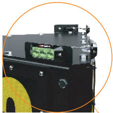
6x XTP Series green flashing lights